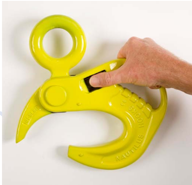
We make to Hook

An employer providing lifting equipment for use in the workplace MUST ensure that the risks created by the use of the equipment are eliminated, or controlled where possible, by providing the appropriate hardware measures.