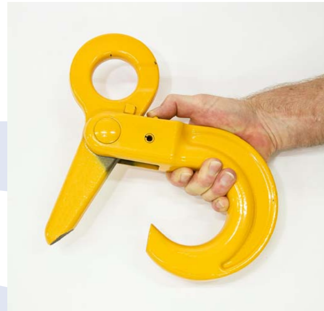
You Make the choice