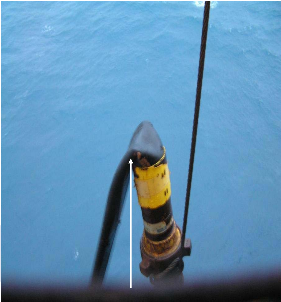
Attachment to Hose Accelerating Wear