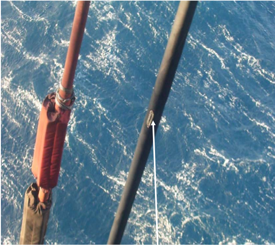
Poor management of hose integrity