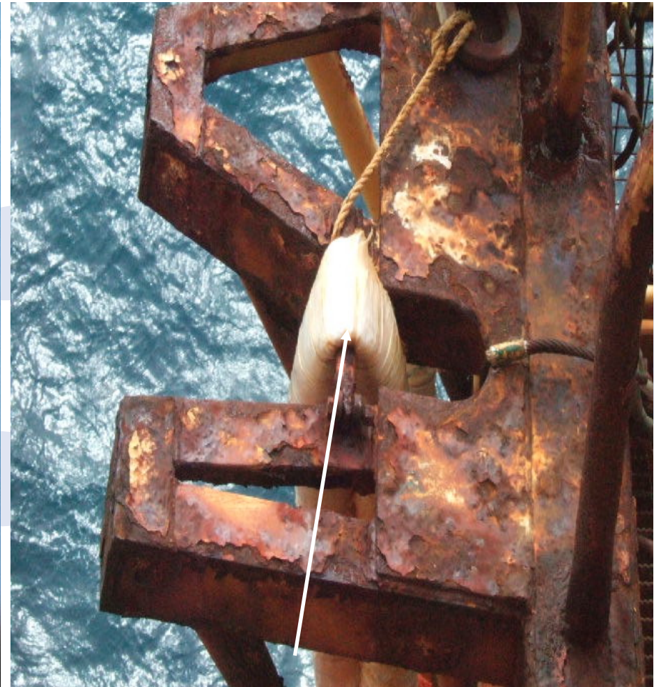
Supporting the hose over the security Pin